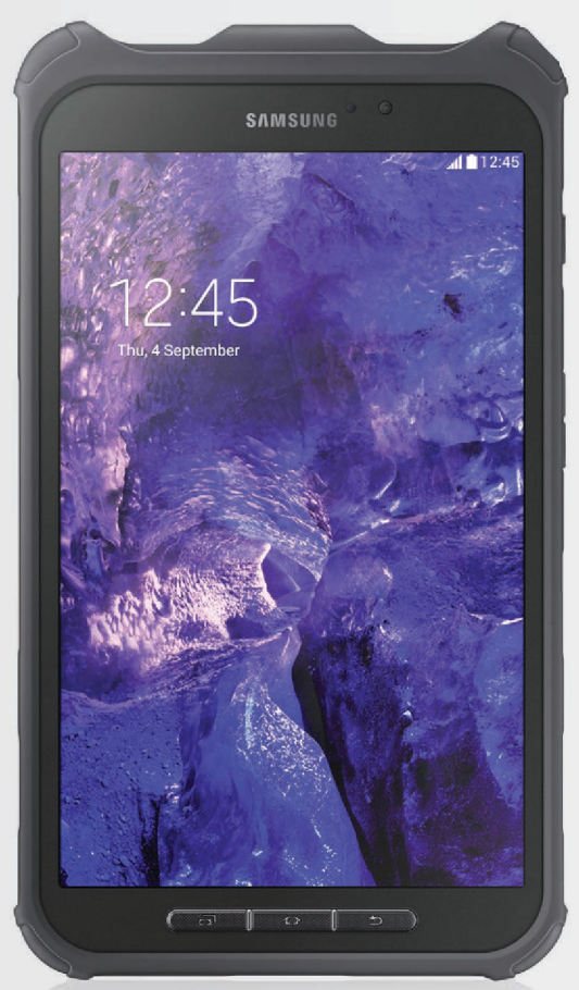
Galaxy Tab® Active (WiFi)

AN EVERYDAY RUGGED TABLET FOR ENTERPRISE WORKFORCES